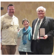
Annual Meeting Recap