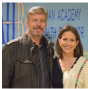
Message from the President