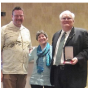
Annual Meeting Recap