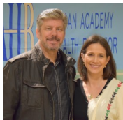
Message from the President